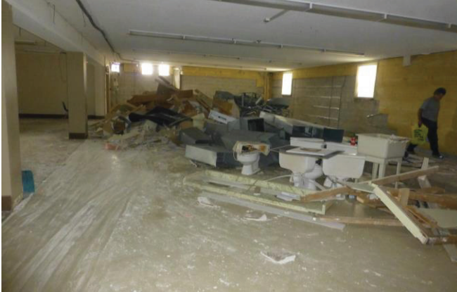
Parish Hall demolition continues