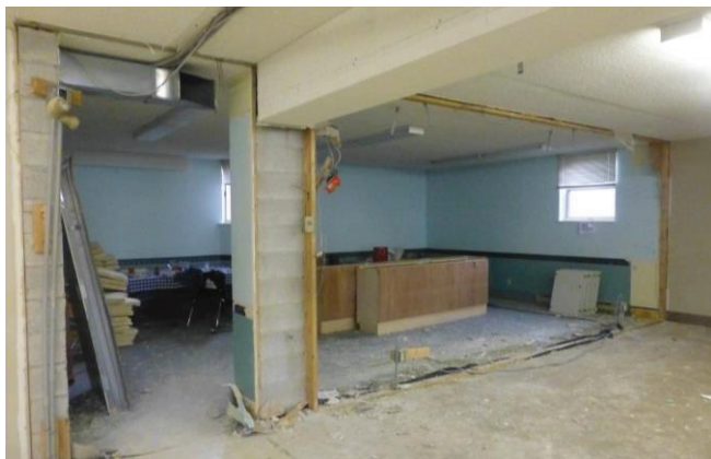
St. Anne's room wall removed